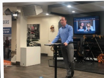
HOPE FOR URUGUAY 100 LAUNCH EVENT IN VALLEY STREAM, NY