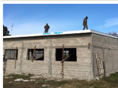
THE ROOF GOING ON