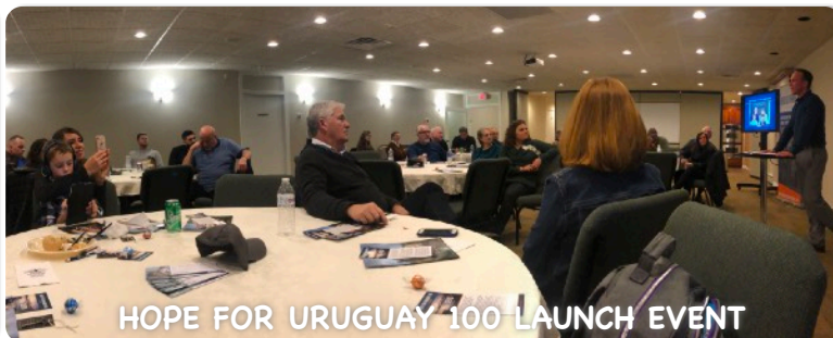
HOPE FOR URUGUAY 100 LAUNCH EVENT