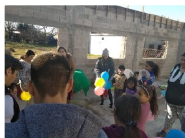
FIRST GATHERING IN THE NEW BUILDING