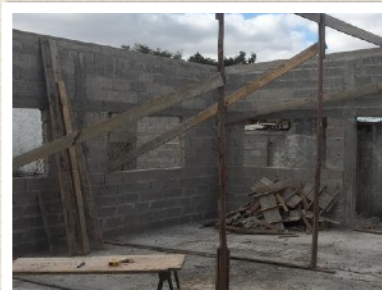
THE WALLS BEING BUILT IN BENZO