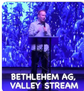
BETHLEHEM AG, VALLEY STREAM

"Untold millions are still untold...We have one business on earth-to save souls." ~John Wesley