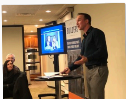
HOPE FOR URUGUAY 100 LAUNCH EVENT IN LIVERPOOL, NY