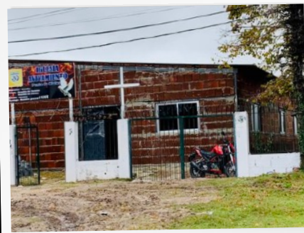
CHURCH CONSTRUCTION IN PUNTA DE RIELES