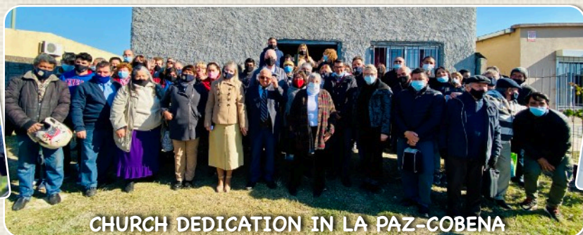
CHURCH DEDICATION IN LA PAZ-COBENA