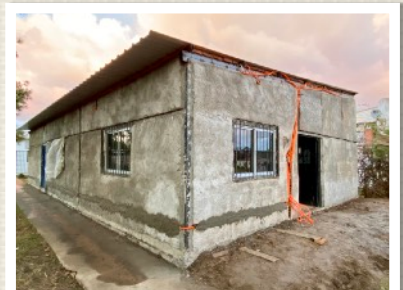
CHURCH CONSTRUCTION IN LA PALOMA