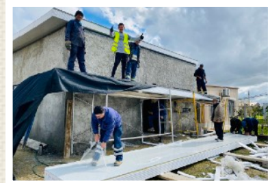
PUTTING ROOF ON IN LA PAZ