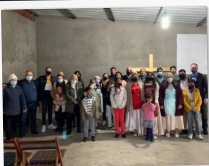
CHURCH DEDICATION IN PUNTA DE RIELES