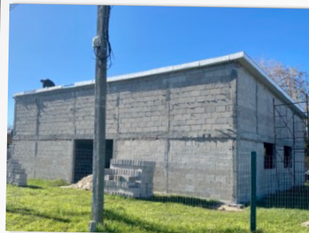
CHURCH CONSTRUCTION IN BARROS BLANCOS