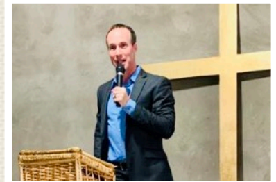
PREACHING DEDICATION IN PUNTA DE RIELES