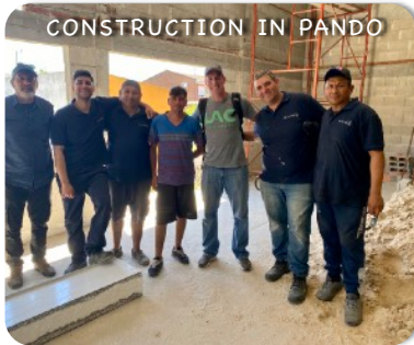
CONSTRUCTION IN PANDO

"Missionaries are very human folks, simply a bunch of nobodies trying to exalt somebody." —Jim Elliot