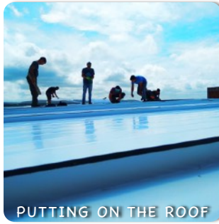
PUTTING ON THE ROOF