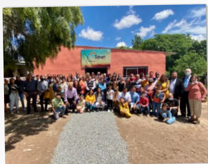
CHURCH DEDICATION IN CAÑADA NIETO