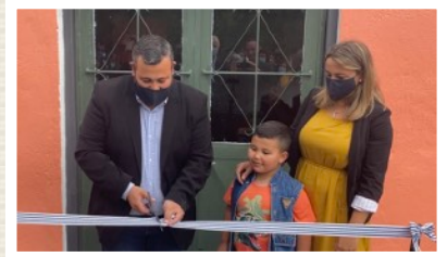
RIBBON CUTTING IN CAÑADA NIETO