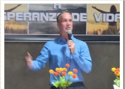
SHARING AT DEDICATION SERVICE IN SALTO