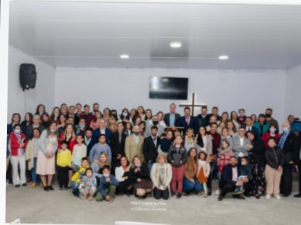
CHURCH DEDICATION IN SAN CARLOS