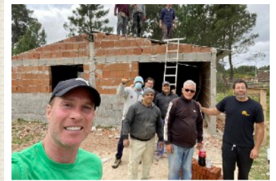
CONSTRUCTION IN PINAMAR