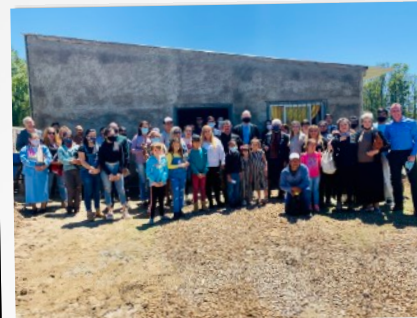
CHURCH DEDICATION IN SALTO