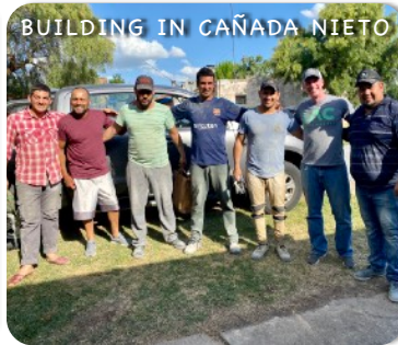
BUILDING IN CAÑADA NIETO